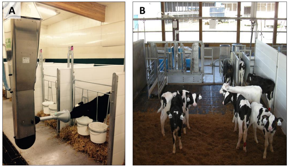
Figure 2. Novel technologies in Western Canada implemented at the University of Alberta Dairy Research and Technology Centre (Edmonton, Alberta) and University of British Columbia (Agassiz BC). A) Calf-Rail technology for automated feeding of calves housed in individual pens at the University of Alberta B) Automated milk, concentrate and hay feeders at University of British Columbia.

Researchers in Western Canada are increasingly utilizing and studying automated technologies due to their vast potential in the dairy industry (Figure The newest autofeeders, which offer the ability to feed milk or milk 2). replacer (termed combination feeders) and pelleted calf starters, are currently being implemented at the University of Alberta and the University of British Columbia. A new technology in calf autofeeding, termed the calf-rail (Figure 2A), can automatically feed individually housed calves milk multiple times during the day. This technology is already being implemented on farms in Germany; the Dairy Research and Technology Centre at the University of Alberta is the first to employ this technology in Western Canada. This system is designed for producers that prefer the benefit of managing calves in individually housed calves preweaning before moving to group-housed calves. Additional technologies that are implemented at the University of Alberta and University of British Columbia include the water meters, feed bunks to measure texturized feed and forage consumption in realtime, and body scales at the feeding station. These technologies are not only helpful for research, but may be valuable at the farm level to detect diseases from water and feed intake patterns, especially during weaning.